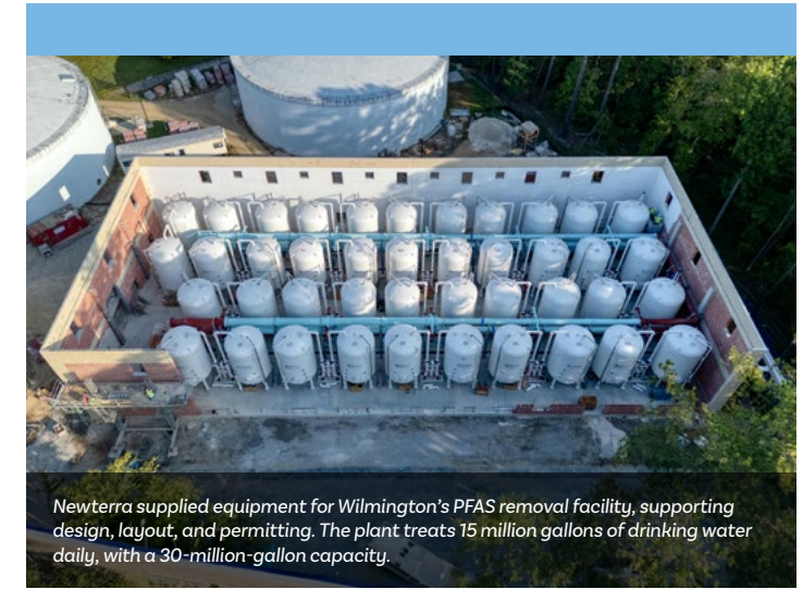
Newterra supplied equipment for Wilmington’s PFAS removal facility, supporting design, layout, and permitting. The plant treats 15 million gallons of drinking water daily, with a 30-million-gallon capacity.