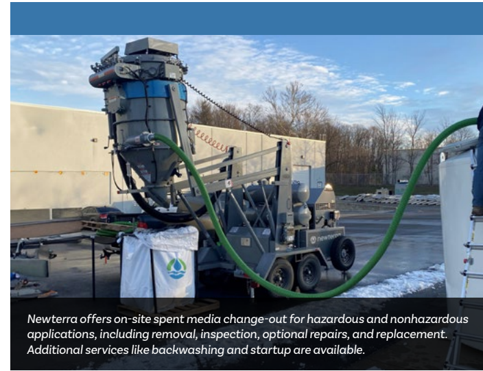
Newterra offers on-site spent media change-out for hazardous and nonhazardous applications, including removal, inspection, optional repairs, and replacement. Additional services like backwashing and startup are available.

By choosing Newterra, you gain access to a wealth of knowledge , ensuring innovative and effective solutions supported by decades of research, development, and market-leading products .