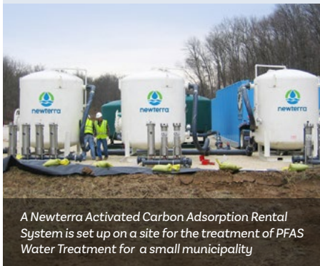
A Newterra Activated Carbon Adsorption Rental System is set up on a site for the treatment of PFAS Water Treatment for a small municipality

Untreated PFAS contamination harms the environment, health, economy, and society , persisting in ecosystems and posing risks like cancer and immune suppression. It drives costly cleanups, legal penalties, and community distrust. Proper treatment is essential to protect health and resources.